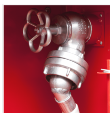
52 VALVE WITH SLANT REDUCTION

Hydrant can be connected to DN52 water supply due to 52 valve with slant reduction