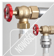
25 VALVE WITH ROTATING ADAPTER - OPTIONAL